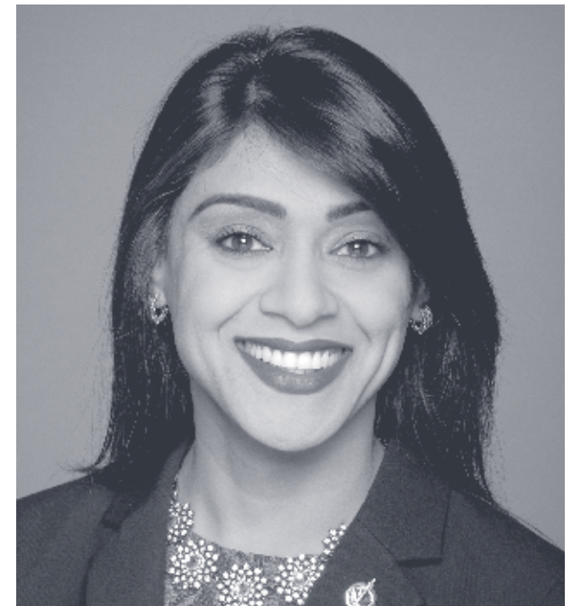
The Honourable Bardish Chagger Minister of Small Business and Tourism