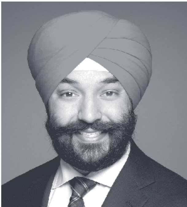
The Honourable Navdeep Bains Minister of Innovation, Science and Economic Development

Western Economic Diversification Canada is proud to have AWE as a partner in the Western Canada Business Service Network. Our partnership has enabled many women to start or grow their businesses, which has created jobs and promoted economic growth in Alberta. We look forward to our continued collaboration and celebrating successes with AWE. Together, we are strengthening Canada's competitiveness and securing a prosperous future for all Canadians.