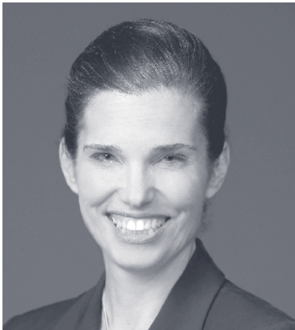
The Honourable Kirsty Duncan Minister of Science